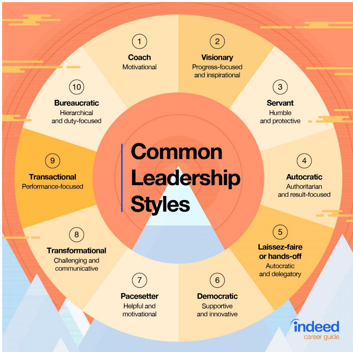
Figure 1 - Common Leadership Styles

According to Gallup (2021), only 20% of employees are engaged in the workplace. Managers can use different methods to increase employee engagement, for example by putting in place efficient practices. They can also improve communication, provide feedback, give recognition, encourage interaction, focus on employee wellbeing, and emphasise employee culture.